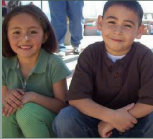
Residents of Sawmill CLT celebrate Easter