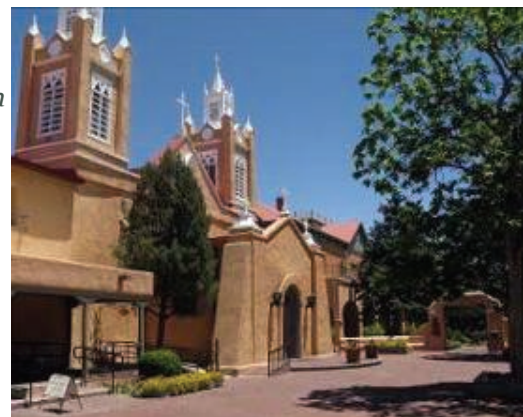
San Felipe de Neri Church, located in Old Town Plaza

The local weather during the second week of November, 2009, had nighttime temperatures of 40-48 degrees and daytime temperatures of 51-69 degrees, including some rain. It then snowed on November 15. Come prepared!