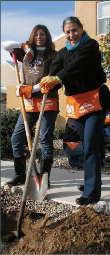
2009 Community Tree Planting Day