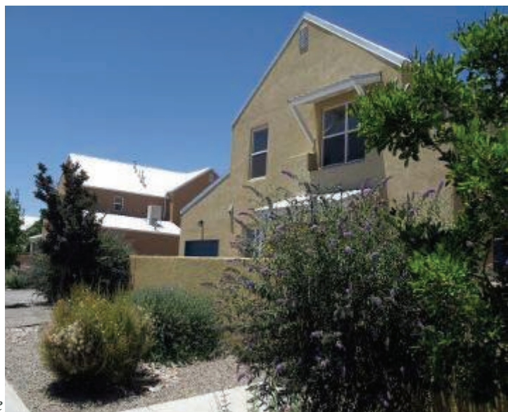
Townhomes from Sawmill CLT's second phase