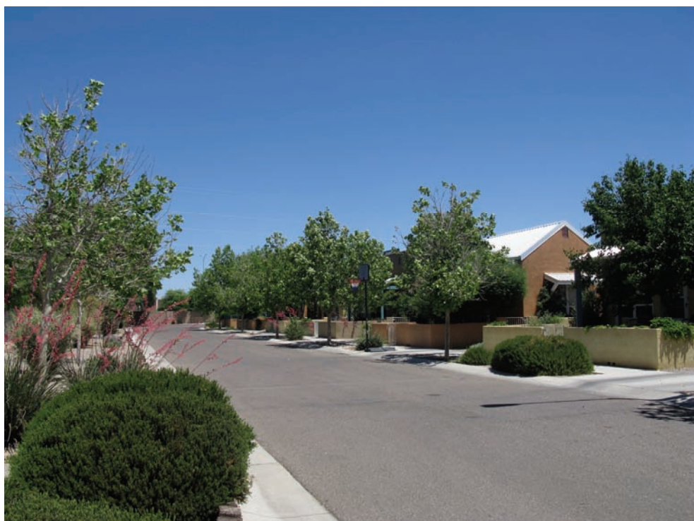
Single family detached homes from Sawmill CLT's first phase