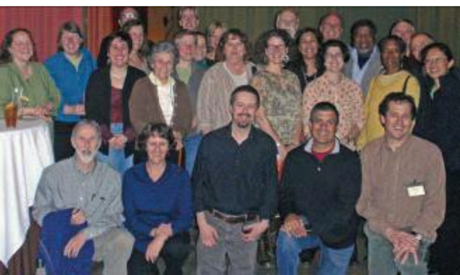
Network Leadership Team, April 2010