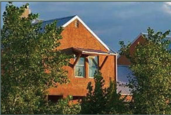
Sawmill CLT Phase 2 house at sunset