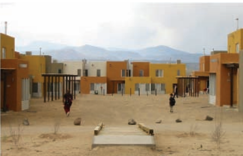
Tsigo Bugeh Village at Ohkay Owingeh Pueblo

Register early - there will be a limit of 40 people for the tour!